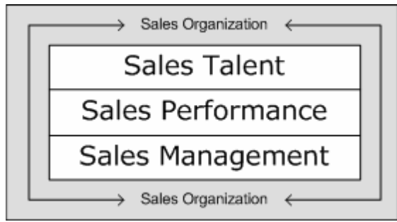
Figure 2: Sales Operational Components

Sales Talent is addressed within component #1 of the PPA Model – People. Sales Performance is addressed within component #2 of the PPA Model – Process. Keep in mind that component #3, Sales Management, is really the cultivation, support and motivation of sales talent and the way that sales talent performs. This, of course, is dependent upon whether the <u>Prescriptive Framework for Sales Success</u> (described above and throughout this white paper) is successfully implemented as the system for Sales Management. All of these components make up the complete sales organization. Planning for these three primary components of the sales operation will go a long way towards building and developing a highly productive results-driven sales team!